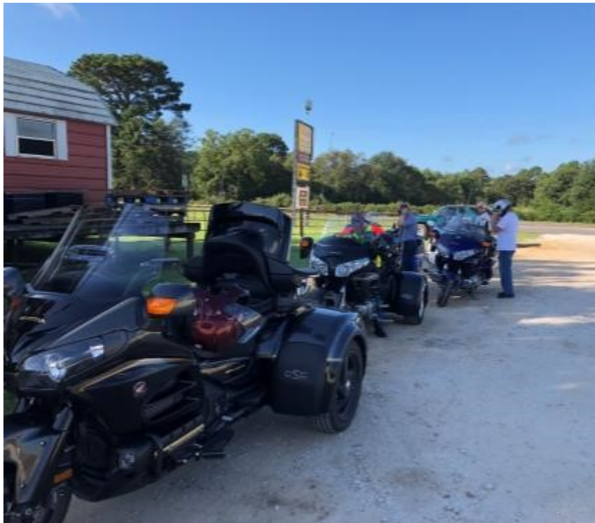
Rest Stop in Pennington

On the way back we went through Crocket and Lovelady for a change in scenery before rejoining the track up in Trinity. We were home by mid-afternoon and best of all, avoided the rain that seemed to plague October.